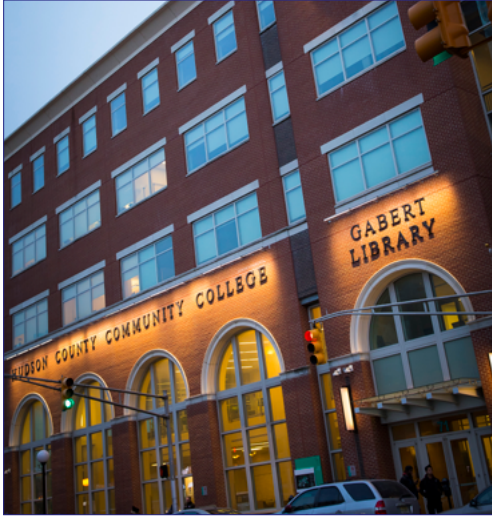
JOURNAL SQUARE CAMPUS 70 Sip Avenue Jersey City, NJ (adjacent to Journal Square PATH Station)