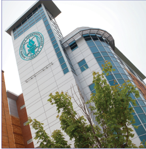
NORTH HUDSON CAMPUS 4800 Kennedy Boulevard Union City, NJ (adjacent to NJ Transit Bergenline Avenue Transit Center)