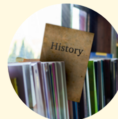
Liberal Arts – History