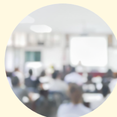
Liberal Arts – General