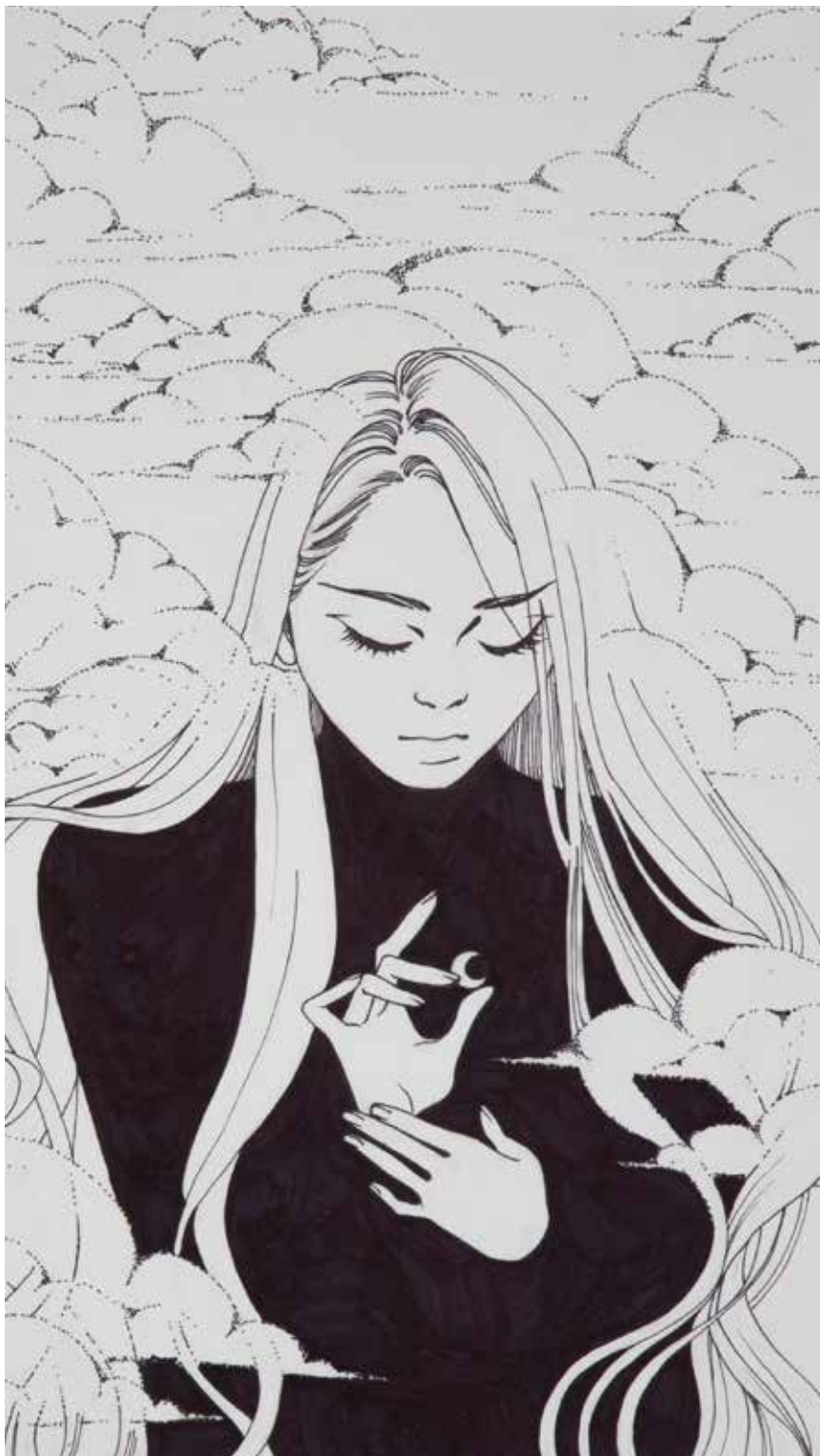
Isha Apalisok, Hey Moon (Please Forget To Fall Down) , Pen and marker on paper