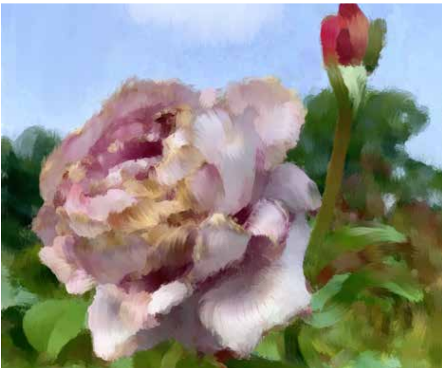
Nickalus Seebraran, Decaying Beauty , 2022, Digital Illustration