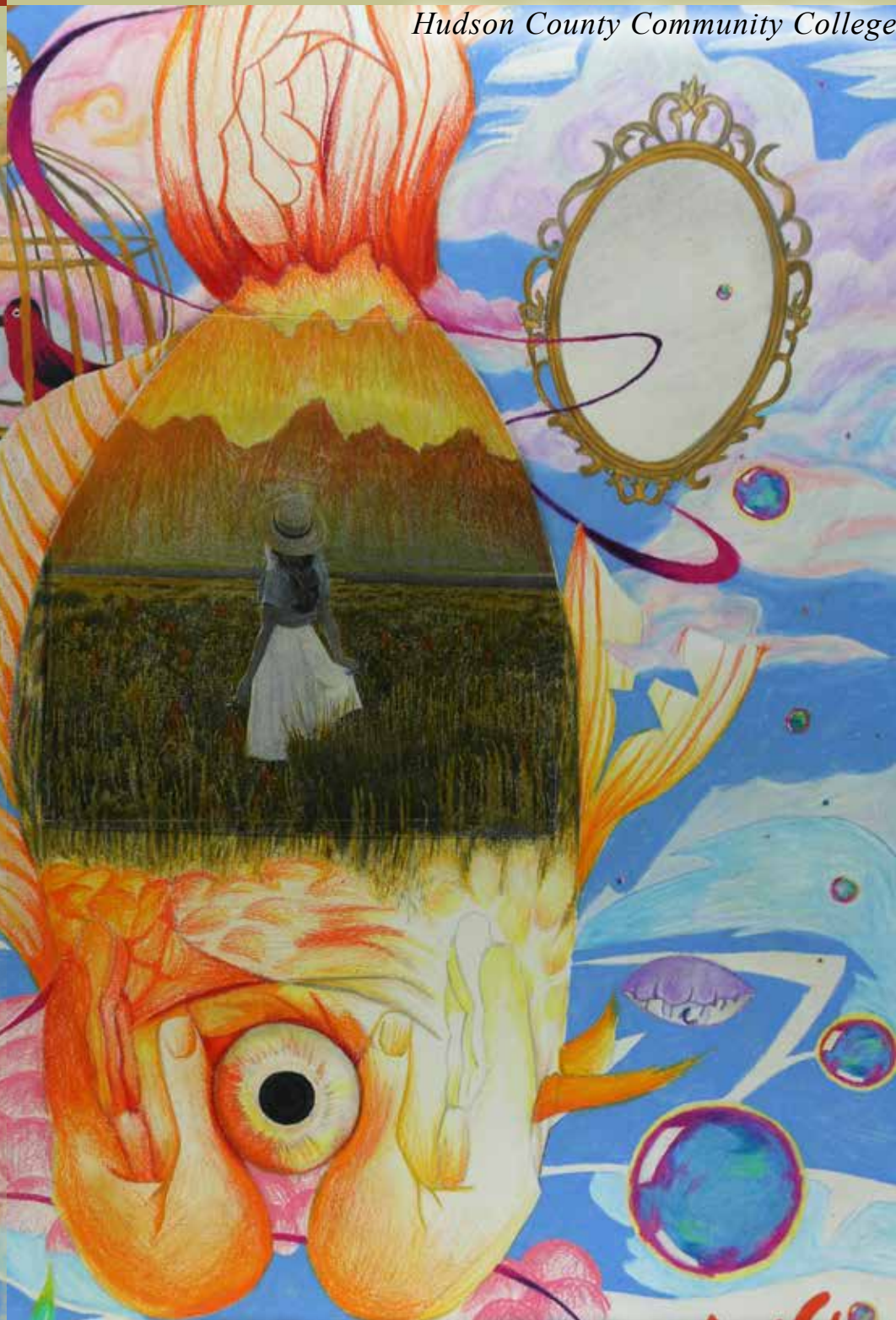
Zariah Alfaro, Lost Compass , 2022, Graphite and color pencil on paper