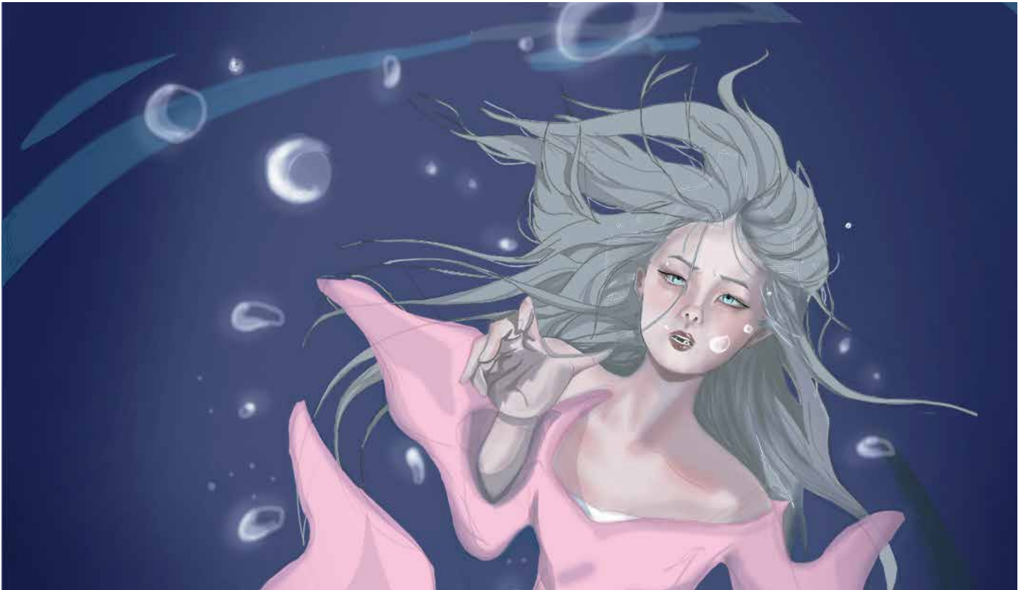
Zariah Alfaro, Submerged in blue , 2022, Digital Illustration