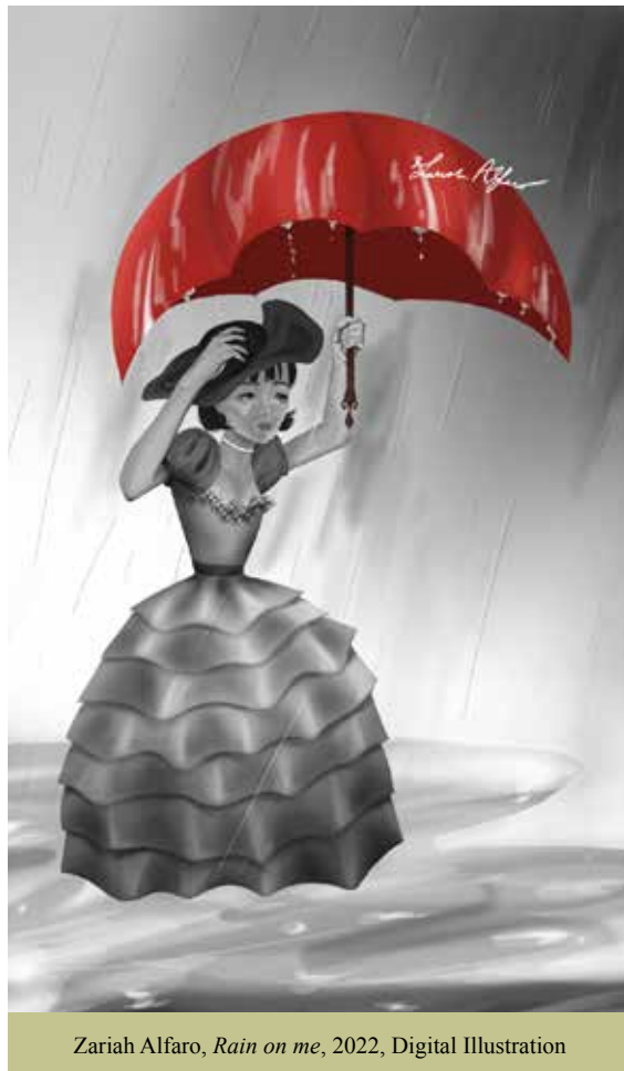
Zariah Alfaro, Rain on me , 2022, Digital Illustration