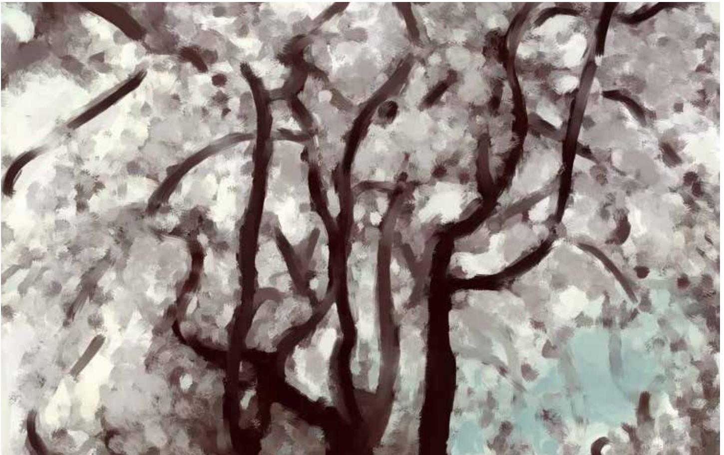
Nickalus Seebaran, Springs Silhouette , 2022, Digital Illustration