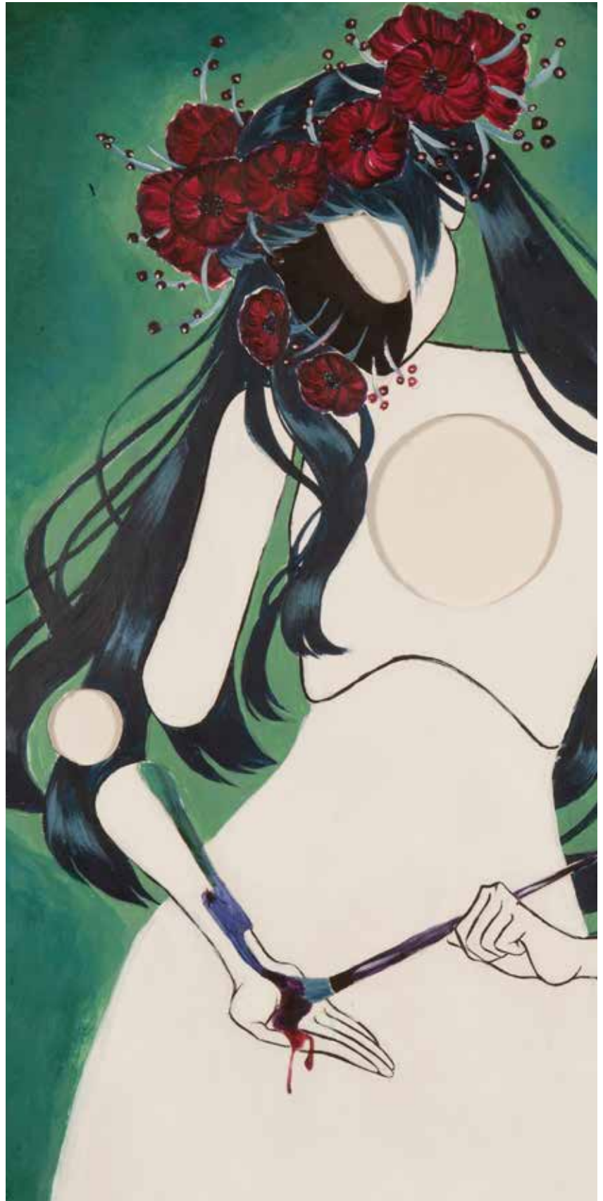
Isha Apalisok, (Un)made , Acrylic on bristol