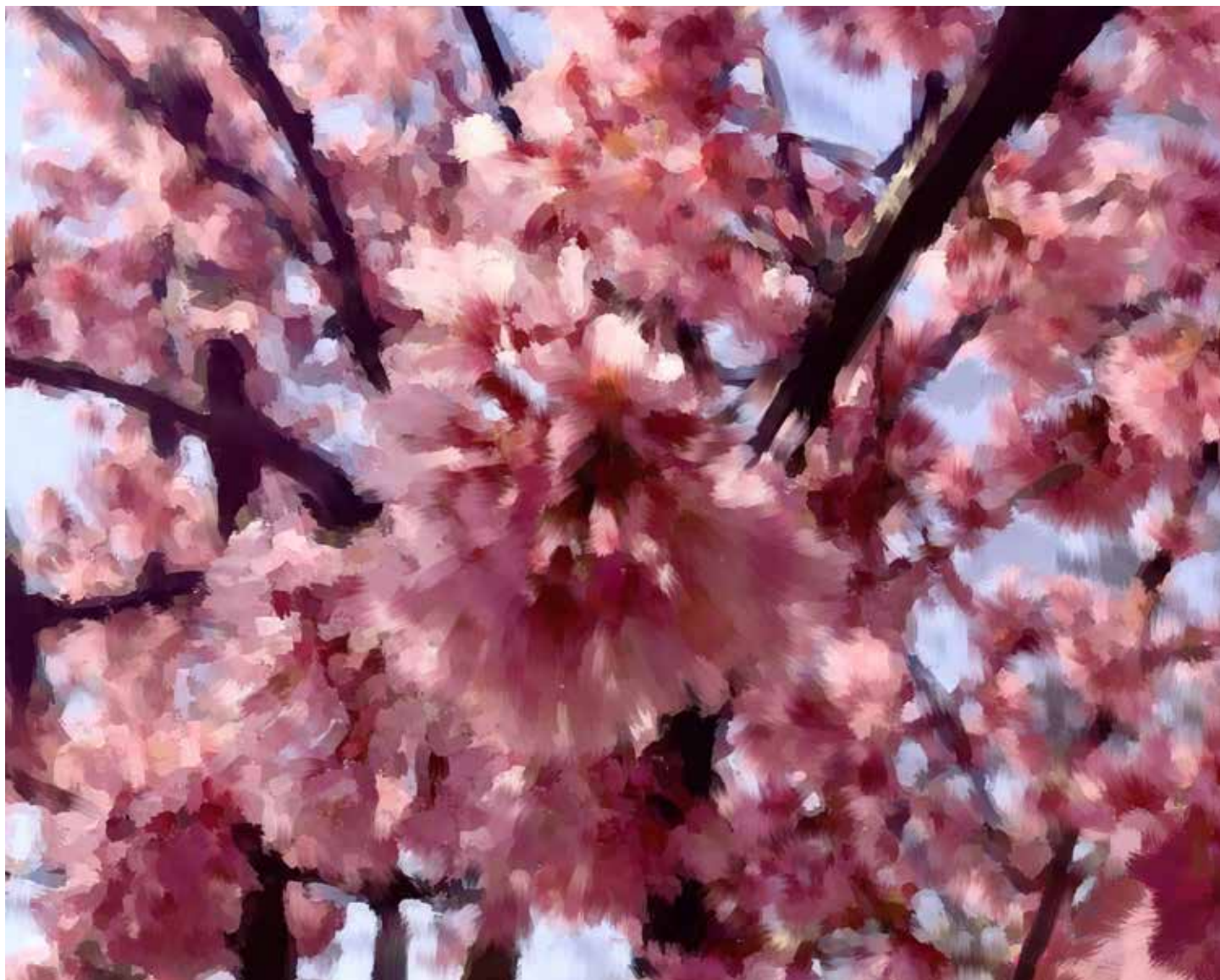
Nickalus Seeban, Springs Shimmer , 2021, Digital Illustration