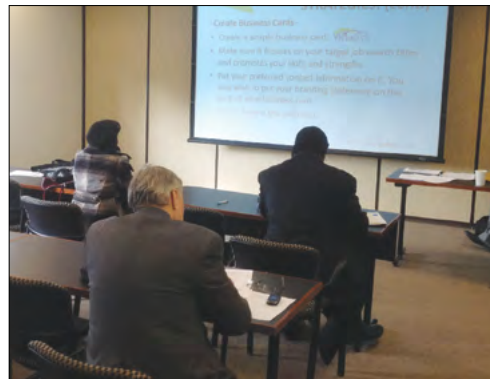
Networking workshop facilitated by a representative from the NJ Department of Labor.