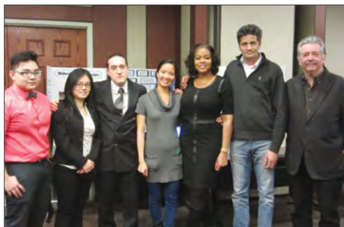
Faculty and students in front of the chemistry and calculus posters at the Honors Poster Showcase.