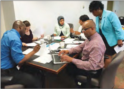
The Academic Affairs Strategic Planning Committee met in June to provide status reports and develop important goals.

The Academic Affairs Strategic Planning group reconvened on Wednesday June 17 to update the status of initiatives, review action items, and revise timelines on the master plan. The overarching goals on the plan include: Positioning STEM programs as HCCC Signature Programs; Improving Retention Fall-Over-Fall each Year; Creating a Culture of Assessment throughout the division; and Transforming Developmental Education and ESL programs to impact student success. The meeting was well attended with 29 faculty members, administrators, and staff members in attendance. The following four persons were designated as Chairs for respective goal areas: