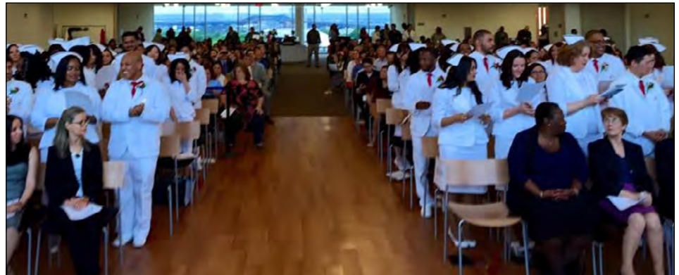
Photo on Left: CarePoint School of Nursing graduates process into the auditorium at Saint Peter's University at the start of the graduation ceremony. Photo above: A capacity audience attended CarePoint School of Nursing's graduation on June 4.