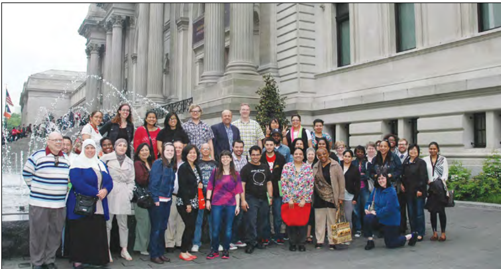
Members of the College Libraries staff in front of the Metropolitan Museum of Art on Fifth Avenue in New York City.

For its third annual Professional Development Day on Tuesday, May 19, 42 Library staff members took a field trip to the Metropolitan Museum of Art. The staff was divided into small groups and assigned a gallery to visit. Each group documented their gallery by taking notes and using the Library iPads to take photos. Staff then returned to the Culinary Conference Center and had lunch, after which each group gave a presentation on their assigned gallery. Approximately half the staff members had never been to the Met before, so it was an especially enriching experience. Each group handled the assignment differently, and everyone was excited to have an opportunity to visit such an amazing place.