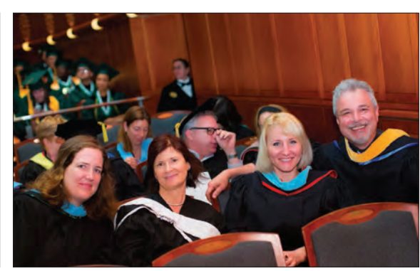
College faculty members await the processional of the stage party during the ceremonies.