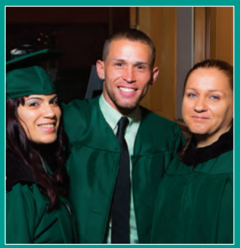
Graduates congregate prior to the ceremony.

Commencement photos taken by Jersey Pictures during the ceremony may be viewed for purchase at www.digiproofs.com (password: 052313HCCC). The galleries will be available until November 1, 2013.