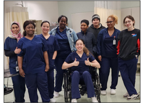
The Gateway to Innovation - Enhanced Certified Nurse Aide class completed their Skills Evaluation on Friday, May 12.

Continuing Education & Workforce Development (CEWD) launched a workshop to assist students and alumni in preparing for an interview. They discussed different topics such as "Writing an Impressive Resume," "Dress to Impress," "Preparing for an Interview" and "How to Address Interview Questions." The attendees actively participated during the workshop, and felt more prepared for the Job Fair on May 23, 2023 in Jersey City hosted by CEWD.