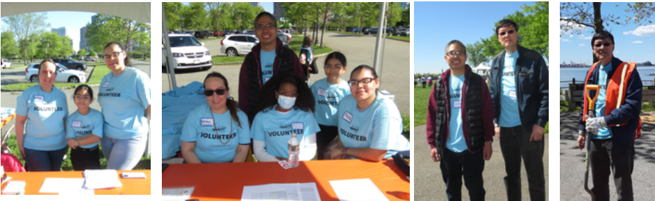
On Saturday, May 6, the Beta Alpha Phi chapter of Phi Theta Kappa volunteered at the National MS Society's Walk MS and in the gardening program at Liberty State Park.