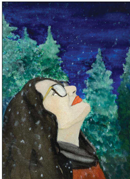
Elaf Hussein, Romina; The First Frost (2021), Watercolor on Paper, 12" x 9"

The recognition of long-neglected artists seems to be a "thing" this spring: Jaune Quick-To-See-Smith continues to get wonderful reviews for her