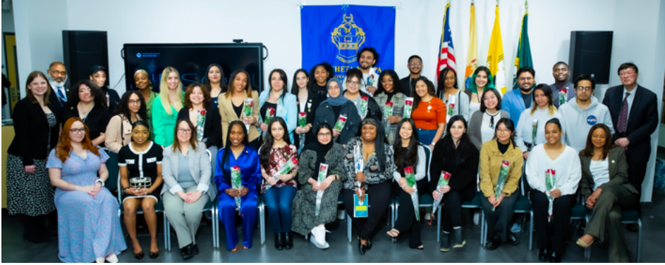
Beta Alpha Phi Chapter inducted more than 100 new members at its induction ceremony on Friday, April 28.