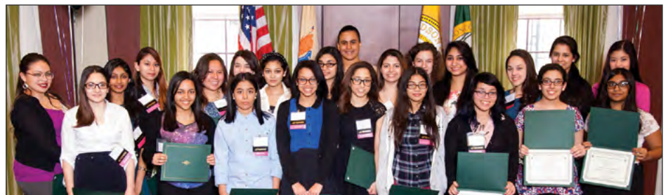
Girls in Technology Student Display Contestants.