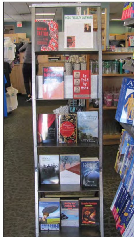
Bookstore-on-the-Square has a display of titles by authors who are on Hudson County Community College faculty.