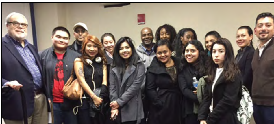
Members of the Psychology Club recently attended a "Friday Night Live" session at the Albert Ellis Institute, which featured a live demonstration of Rational Emotive Behavior Therapy.