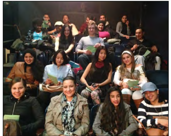
Students from Hudson County Community College’s ESL program attended a performance of the Educational Theater of New York, housed at the Clarion Theatre, on March 26.