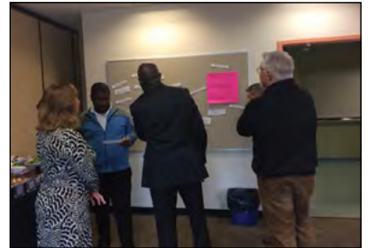
Participants assess leadership quotes at LEAD Hudson County on Oct. 21 at the Culinary Conference Center.