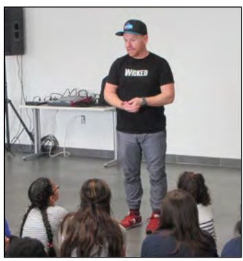
n Friday, Oct. 7, Eddie Pendergraft of Broadway's Wicked led a workshop on choreography. In addition to acting, Pendergraft is a costume and set designer.