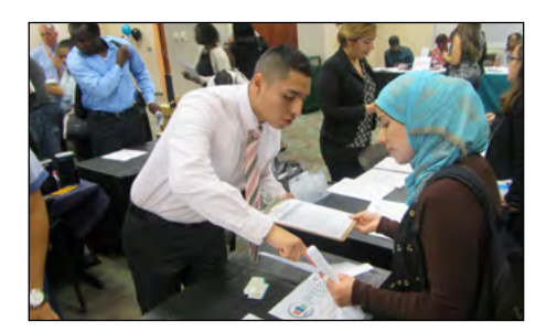
Student (right) networks with Best in Care representative.

ore than 300 students networked with nearly 50 employers and vendors at the Journal Square Campus Job and Internship Fair, held on Oct. 18, 2016 from 11 a.m. to 2 p.m. in the Culinary Conference Center. Along with faculty, staff, and community job seekers, students learned about local businesses, completed employment applications, and explored different job markets.