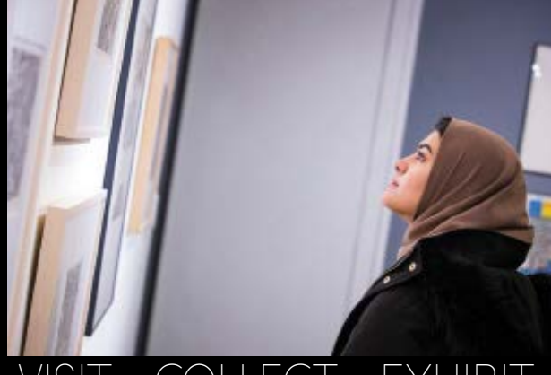
VISIT • COLLECT • EXHIBIT

Community partners include HCCC PACDEI Student Action Group, Goya, the Jersey Room, the Museum of Jersey City History, the National Honors Society at McNair High School, the NJ Reentry Program, and the Poetry and Language Collective, among others.