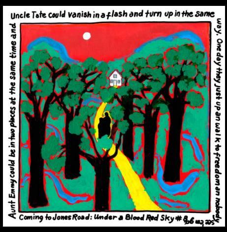
Faith Ringgold, Coming to Jones Road, Under a Blood Red Sky #8