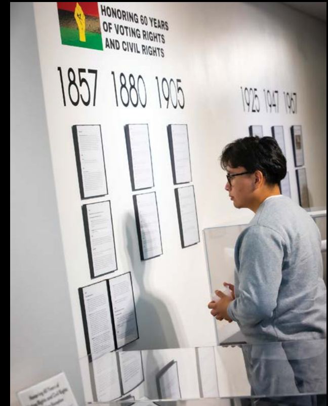
'Honoring 60 Years of Voting Rights and Civil Rights' exhibition

BENJAMIN J. DINEEN III & DENNIS C. HULL GALLERY AND THE OFFICE OF CULTURAL AFFAIRS FOR DIVERSITY, EQUITY AND INCLUSION