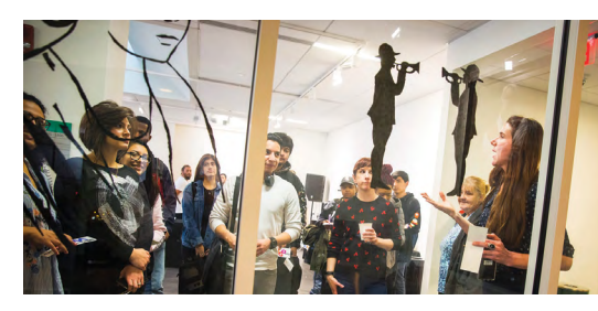
ART CAFI December 13, 8:30-9:30 a.m. Dineen Hull Gallery Atrium

DOCA invites students, faculty, and community members to enjoy a complimentary cup of coffee and Manhattan views on the roof terrace and to tour the HCCC Student Art Exhibition.