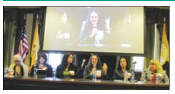
"A Day in The Life of Women in IT" panel discussion.

n Wednesday, March 26, 2014, nearly 200 female students from fourteen high schools in Hudson County and the surrounding area came to Hudson County Community College (HCCC) for the "2014 Women in Technology Symposium." The first annual event was held at the HCCC Culinary Arts Conference Center in Jersey City.