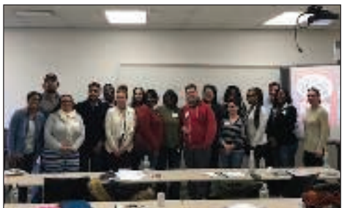
Scenes from Continuing Education's Food Business Bootcamp partnership with Hudson Kitchen on February 23.