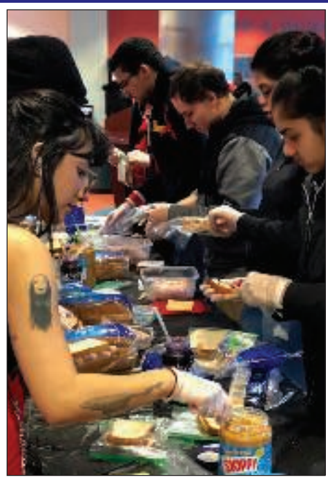
On March 7, 2019, the Office of Student Activities hosted a sandwich-making event at the North Hudson Campus. Students made sandwiches which were then donated to Union City's Palisades Emergency Residence Corporation (PERC), which serves as a homeless shelter, food pantry, soup kitchen, and more to those in need.