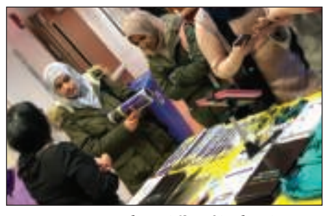
Time to get connected! The Office of Student Activities hosted its Student Involvement Fair, where students were able to learn about different involvement opportunities on campus and meet student leaders.