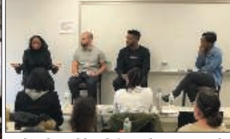
Students learned directly from industry experts who shared the tools and strategies needed to move their food ideas from concept to reality. The next Food Business Bootcamp is Saturday, May 18! Register at: foodbusinessbootcamp.eventbrite.com