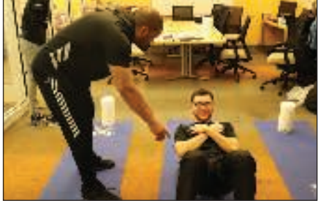
On Monday, March 11, students in Hudson County Community College's Personal Fitness Training Certificate Program gave a demonstration of the use of foam rollers. Foam rolling before a workout decreases muscle density and sets the stage for a better warmuр.