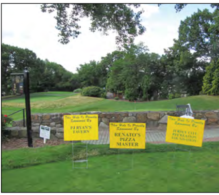
Some of the event's Hole Sponsors.