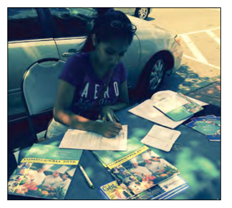
A woman applies for admission to HCCC at the Union City Farmers Market.