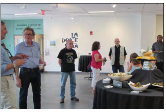
collections of The Center for the Arts at Casa during an artists' reception of "La Dolce Vita." Colombo in Jersey City.