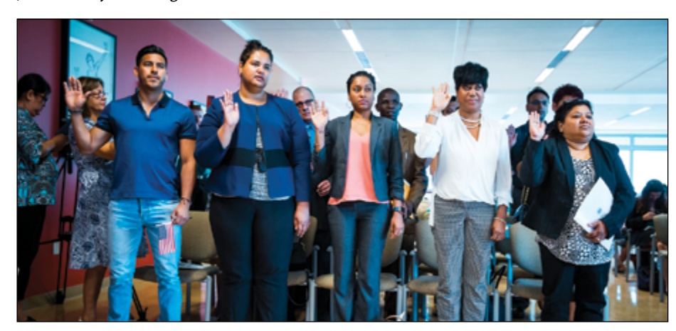
Candidates for naturalization take the oath of citizenship at Hudson County Community College's North Hudson Campus on July 11.