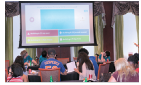
Attendees participate in a fun trivia game to test their knowledge from the day's sessions.