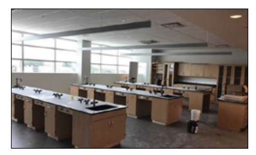
In stall at ion\ of\ for bo\ floor\ material\ in\ Room\ 508.