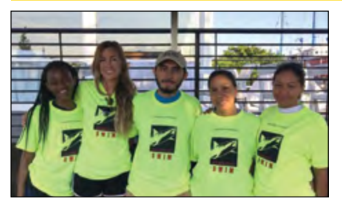
Beta Alpha Phi members and alumni volunteering at the Lady Liberty SharkFest swim on June 30.