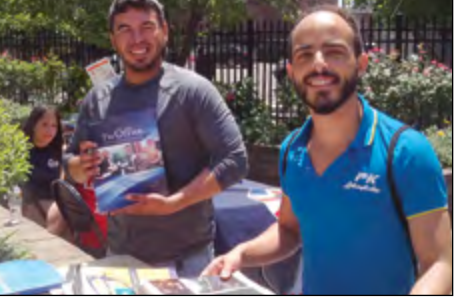
The annual Book Fair afforded attendees young and old an opportunity to buy new and used books, shop, and participate in book readings and activities.

Summer fairs offer an ideal way for families to enjoy outdoor entertainment and activities, and to connect with members of their community. The fairs also provide neighborhood, small businesses with opportunities to sell their products and services.