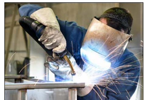
Hudson County Community College is one of only 10 community colleges in the U.S. named to the Metallica Scholars Initiative Cohort 4. The College will provide instruction and a pathway to certification in welding for previously incarcerated individuals.

The Metallica Scholars Initiative funding will provide students with tuition, textbooks, materials, Occupational Health and Safety Administration (OSHA) 10 training, consumables, helmets, safety glasses, jackets, and exam fees for American Welding Society certification. The scholars will also receive support from Hudson County Community College Student Success Coaches, plus tutoring, case management,