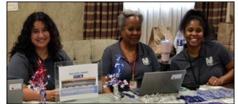
On July 21, 2022, recruiters from TLD (Transportation, Logistics, and Distribution), NJ Transit, Council for Airport Opportunity, and PANYNJ met HCCC alumni during the Career Fair 2022 event. Pictured are the three recruiters from NJ Transit who held one-on-one interviews with candidates for various company job opportunities.

recruiting for 10 companies. This level of attendance resulted in building internships, strengthening community partnerships, engaging alumni, and providing employment placements. The attending employers were so satisfied they requested additional HCCC Career Fairs!