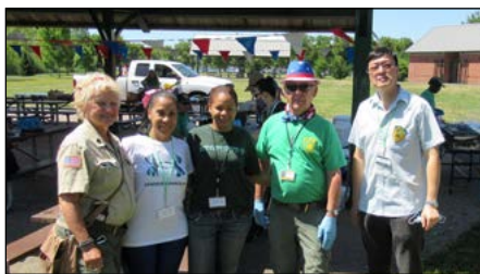
On Monday, July 4, Phi Theta Kappa volunteered at the picnic for state workers at Liberty State Park as they have done for 10 years. For the holiday, many were reassigned from other park and forest divisions to help at Liberty State Park each year.