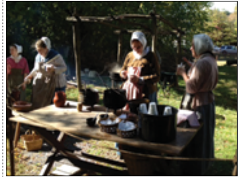
A docent and assistant explain how candles are made.

On Sunday, October 20, a group of Hudson County Community College students, faculty, and staff journeyed back in time at Historic Richmondtown in Staten Island to celebrate "Old Home Day," a New England tradition to welcome home past residents.