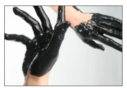
Stephanie Mendez, Untitled #5, 2020, Film Still

JC Fridays - Founder, Container Globe <a href="https://www.jcfridays.com/">www.thecontainerglobe.com</a> For more information and to participate, visit: <a href="https://www.jcfridays.com/">https://www.jcfridays.com/</a>