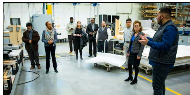
Administrators are given a tour of Eastern Millwork.