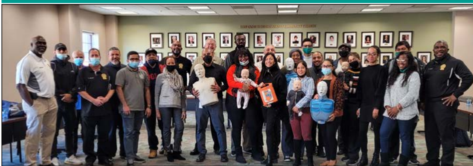
HCCC team members underwent CPR/AED training on Nov. 16.

On Tuesday, Nov. 16, the Office of Safety & Security held a certification training for Hudson County Community College participants. The CPR-AED course trains participants to provide CPR, and use an automated external defibrillator (AED) in a safe, timely, and effective manner.