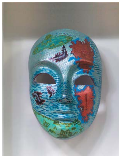
"Voyages 13: Sardaigne," 2004, 8 3/8" x 5 3/8" x 4", Cast Paper, Watercolor and Acrylic by Joyce Kozloff.

Each month, this page in HCCC Happenings provides updates on artists whose work is in the collection, and new additions to the collection.