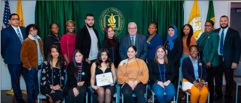
Inductees of HCCC's Alpha Alpha Honor Society.