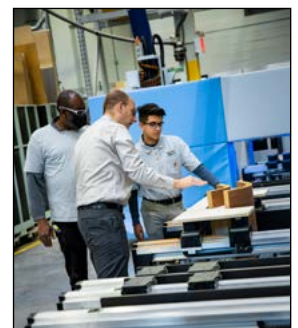
Student-apprentices operate equipment at the Eastern Millwork site.

Hudson County Community College (HCCC) and Eastern Millwork, Inc., partners in the Holz Technik Advanced Manufacturing Apprenticeship Program, co-hosted a “Celebration of Collaboration” and welcomed Thomas Edison State University (TESU) as the four-year college destination for students in the program. The event was held Friday afternoon, November 19, 2021, at Eastern Millwork headquarters in Jersey City, NJ.