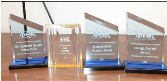
Phi Theta Kappa's international convention, PTK Catalyst 2021, was originally scheduled to be held at the Baltimore Convention Center earlier this year, but was converted to a virtual event. Beta Alpha Phi's awards could not be bestowed in person. Congratulations once again!