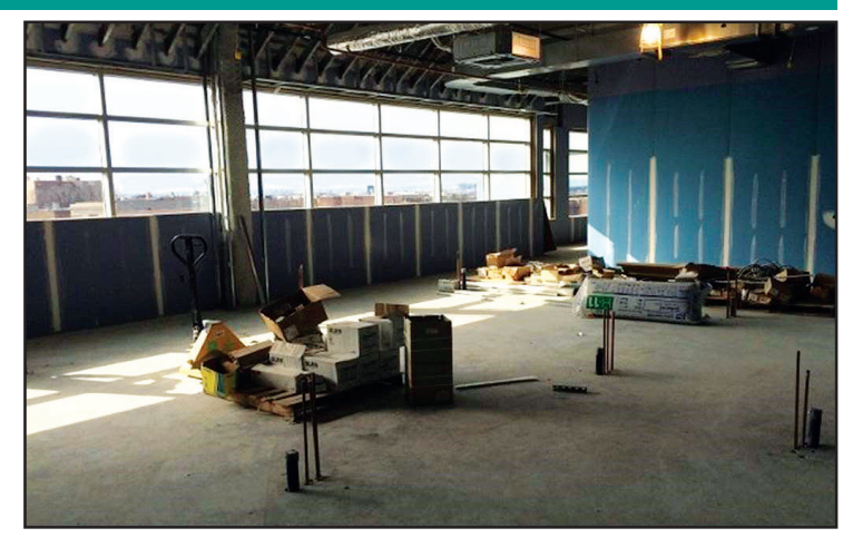
Future Biology Lab in the Hudson County Community College STEM Building, scheduled to open later this year.