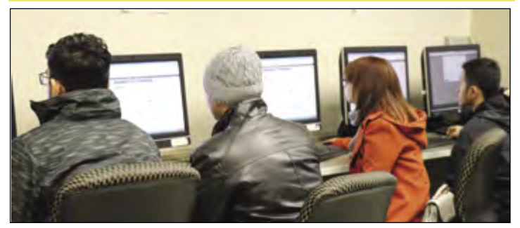
FAFSA Completion Workshops hosted in the Office of Student Financial Assistance's computer lab. These events help students and parents complete the FAFSA online and will continue on Wednesdays through Feb. 6 at North Hudson and Feb. 13 in Journal Square.