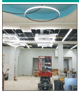
First Floor of the Student Center