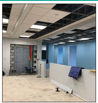
Second\ Floor\ of\ the\ Student\ Center.