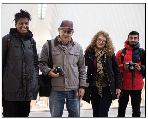
Scenes from CE's intro to digital photography weekend workshop on Jan. 25 and 26.