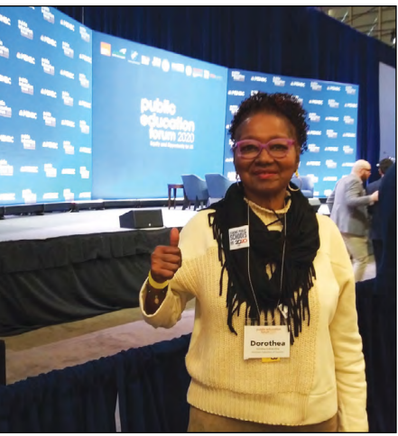
tion Forum 2020 in Pittsburgh.

Some of the issues that students face are food insecurities and homelessness, which are some of the roadblocks. The moderators ensured that when each candidate answered a question that he or she also explained how they would carry out their