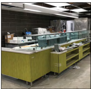
Site of the future Student Center Café. The café will be operated by Flik Hospitality and include healthy meal options.