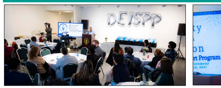
Successful completers of the Diversity, Equity and Inclusion Student Passport Program are recognized in a ceremony on Dec. 10.