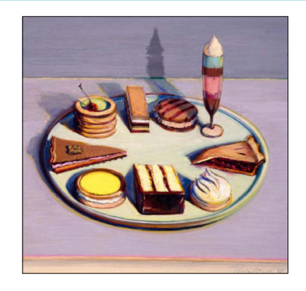
Dessert Tray (ca.1992) by Wayne Thiebaud. Offset Lithograph Signed by the Artist, 32" x 32"

Each month, this page in HCCC Happenings provides updates on artists whose work is in the collection, and new additions to the collection.