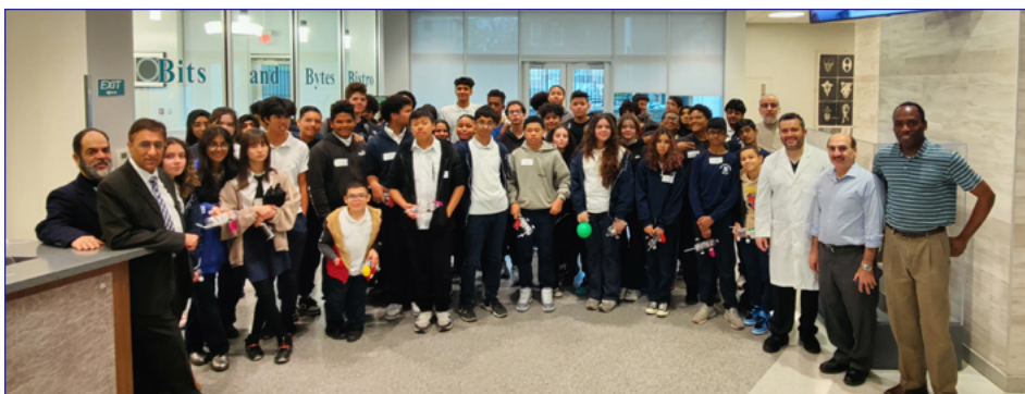
Eighth graders from Jersey City's P.S. #5 visited HCCC for a day of science.

On January 11, 2024, approximately 60 students from the Dr. Michael Conti School PS #5 in Jersey City visited the STEM (Science, Technology, Engineering, and Mathematics) Building at Hudson County Community College.