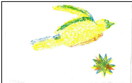
Kiki Smith, Red Breast (2021) Watercolor using Rubber Stamps, 5.75" x 8.5"

Joan Snyder, whose work can be seen on the first floor of 870 Bergen, in the studio arts classroom at 516 Gabert Library, and in the Honors Student area in the tutoring center on the