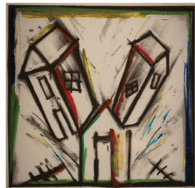
Robert Wilson, Untitled (1990), Print on Paper, 27.625" x 19.75"

You can see photographic work by John Chamberlain on the 2nd floor of the Culinary Conference Center. The artist is most famous for sculptures made from crushed car parts. Some of these metal sculptures are on permanent exhibit at MANA Contemporary, down the road from HCCC at 888 Newark Avenue. If you look closely at these monumental structures you can almost imagine the artist's past history: before he was a sculptor, in the 1960s, he was a hairdresser who constructed huge bouffant hair styles! For those who love Chamberlain's work, and have a ride to Colorado this winter, the Aspen Art Museum will be having a major survey of his work through April 7. Called John Chamberlain: THE TIGHTER THEY'RE WOUND, THE HARDER THEY UNRAVEL , the exhibition explores Chamberlain's career over six decades. It includes work ranging in scale from monumental to miniature. Other materials he used in his sculptures include foam, foil, resin, paper, air ducts and dismantled appliances.