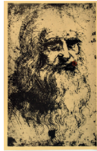
The Father of Mona Lisa (1967) by Man Ray