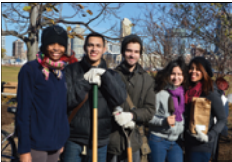
At Liberty State Park: (left)