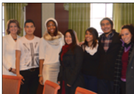
Thanksgiving Luncheon: (right)