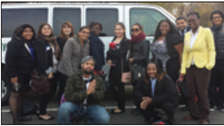
Hudson County Community College was well represented at the Alliance of Educational Opportunity Fund Students of New Jersey Leadership Conference.

On November 15, 2013, students and staff from Educational Opportunity Fund Programs throughout New Jersey came together for a student leadership and a professional development conference at Kean University. The title of the conference "EOF Celebrating 45 Years of Leaders- Yesterday, Today, and Tomorrow," honored the legacy of the leaders who advocated for a program that provides access to higher education to students who are highly motivated and capable, but come from a financially and academically disadvantaged backgrounds, celebrated the successes of our current students, and challenged participants to take the program to greater heights in the years to come.