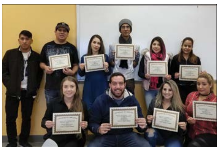
\label{lem:community} \textit{Education's Accelerated ESL students pose with their certificates of completion.}