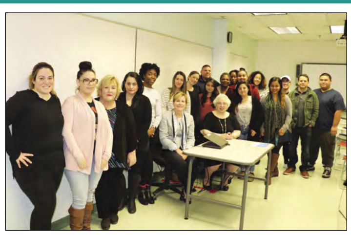
Members of a New Jersey City University bachelor-level course taught at Hudson County Community College, with Division of Nursing & Health Sciences administrators and faculty.

udson County Community College (HCCC) and New Jersey City University (NJCU) have formalized an agreement for an Associate-Baccalaureate Degree Completion Program the HCCC-NJCU RN-BSN at Hudson County Community College.