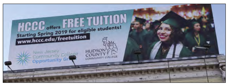
The Community College Opportunity Grant billboard, displayed on Bergenline Avenue and 47th Street in Union City.