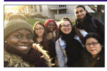
Members of HCCC's Human Services Club visited Seton Hall University in South Orange.

n Monday, December 10, the Human Services Club took a tour of Seton Hall Uni-