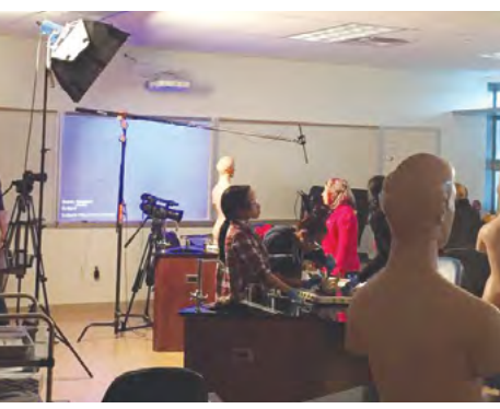
Over three locations and two days, the Communications Department organized a photo and video shoot. More than a dozen testimonials of College students, alumni, faculty and staff members were taped during this period.

The Communications Department recently won two awards in the 30th Annual Educational Advertising Awards sponsored by Higher Education Marketing Report . The department received a Bronze Award for the Outdoor/Billboard campaign and a Merit Award for its Library Building Guide brochure. Communications' winning entries were two among more than 2,000 received from over 1,000 colleges, universities and secondary schools from all 50 states and several foreign countries.