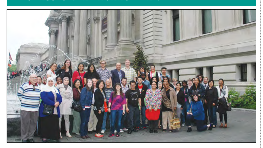
Members of the College Libraries staff in front of the Metropolitan Museum of Art on Fifth Avenue in New York City.

🖥 or its third annual Professional Development Day on Tuesday, May 19, 42 Library staff members took \blacktriangleleft a field trip to the Metropolitan Museum of Art. The staff was divided into small groups and assigned a gallery to visit. Each group documented their gallery by taking notes and using the Library iPads to take photos. Staff then returned to the Culinary Conference Center and had lunch, after which each group gave a presentation on their assigned gallery. Approximately half the staff members had never been to the Met before, so it was an especially enriching experience. Each group handled the assignment differently, and everyone was excited to have an opportunity to visit such an amazing place.