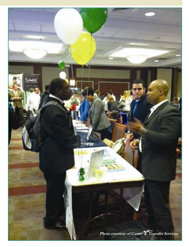
▲ MORE THAN 40 companies met with more than 200 HCCC students at the College's Career Fair on April 19.