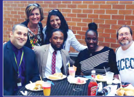
NHHEC End of Year BBQ, May 14