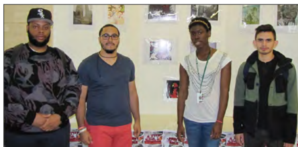
Fine Arts students selling prints.