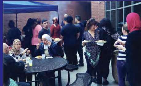
NHHEC End of Year BBQ, May 14