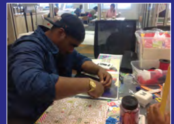
Students had an opportunity to provide custom decorations to their Commencement caps at the Library Makerspace.