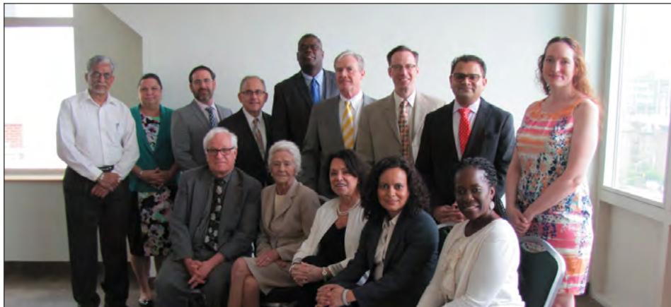
Members of the Hudson County Chamber of Commerce Board of Directors.

The Chamber has been in existence since 1888 and comprises more than 450 businesses and organizations around Hudson County.