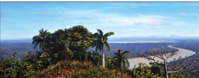
Foundation Art Awards

The Bowers Museum in Santa Ana, California will be presenting an exhibition of photographers of the American West: Ansel Adams, Edward S. Curtis, and Edward Weston, with 42 photographs through Nov. 29. At the time he took the pictures, Edward S. Curtis's urgent drive to photograph what he saw as the vanishing Native American culture, was a lonely man's quest. His monumental work, The North American Indian (1907-1930) , is a 20-volume photographic record and ethnography of many tribes of the western continent. Now, Curtis is described as one of the "most celebrated 20th Century American photographers." You can see over two dozen of his works on the fourth floor of the new Library Building. We would welcome donations of original photographs by the other two gentlemen in the California exhibit, Ansel Adams and Edward Weston.