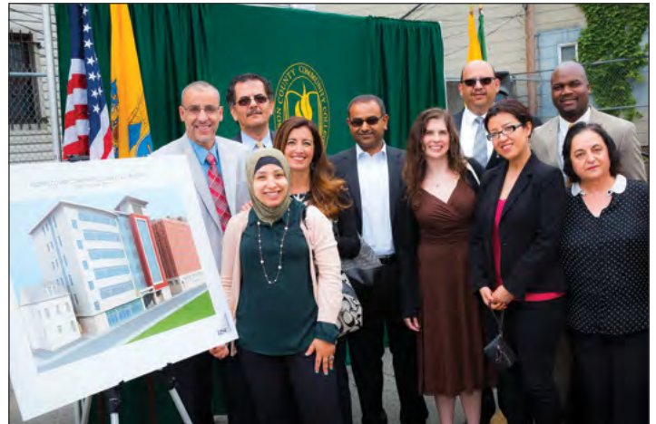
En la foto, Facultad de los Programas STEM (Ciencias, Tecnología, Ingeniería y Matemáticas) de Hudson County Community College posan junto a la maqueta de lo que será el nuevo Edificio STEM.