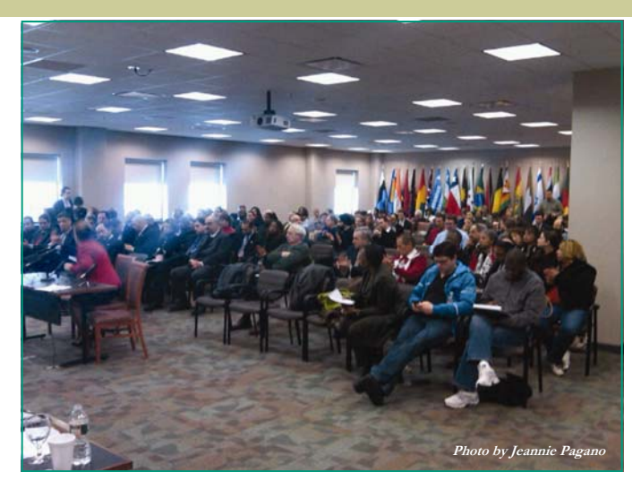
▲ MEMBERS OF the public listen to the proceedings of the state's redistricting meeting at the College on Feb. 13.

Because of the 2010 census figures, municipalities formerly in one Legislative District may be reassigned to another Legislative District. The purpose of redrawing the districts is