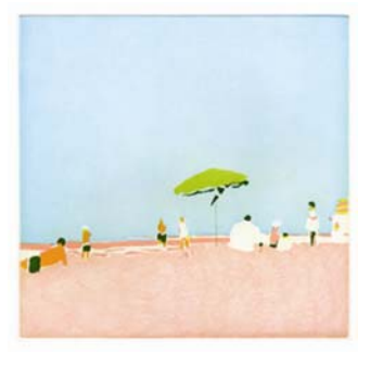
▲ SKY BEACH (Blue) by Isca Greenfield-Sanders will be installed in 2011 at Hudson County Community College.

Hudson County Community College welcomes donations of funds to buy art for the