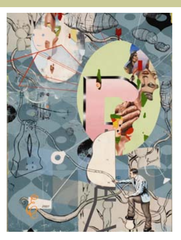
▲ JON RAPPLEYE'S Evolution 2860 AD (2002) on oil and acrylic. Located on the first floor lobby of 2 Enos Place, it is part of the HCCC Permanent Art Collection.

For further information about the series, please contact Andrea Siegel at (201) 360-4007 or asiegel@hccc.edu.