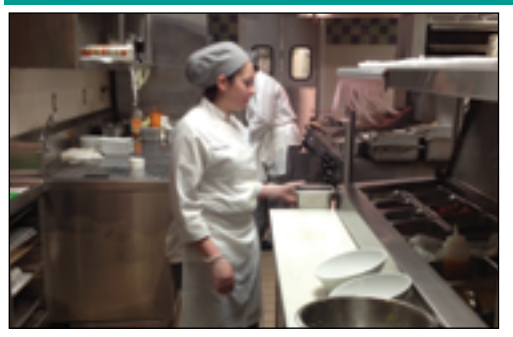
Culinary students prepare menu items for Subscription Dining.

The Hudson County Community College Foundation is offering HCCC faculty, staff, and alumni an opportunity to enjoy worldclass dining and service in your own backyard to help the College in realizing its goals of assisting deserving students! Our Executive Chef, team of culinary professionals, and students make meals at the Culinary Conference Center into experiences to remember.