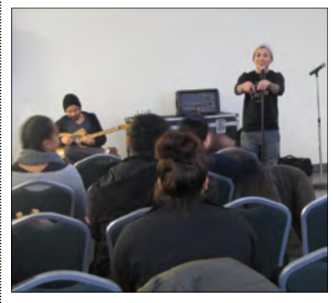
Spoken word artist The Asia Project performed at the Liberty Cafe on Tuesday, Febraury 23.