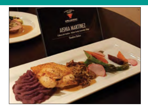
Shandrise Chicken, which is pan roasted chicken breast, with blueberry-infused blue mashed potatoes, sautéed assorted baby carrots, and sea beans prepared by Aisha Martinez.

Aishia's participation beyond the preparation of her dish included an interview in front of over 100 attendees, followed by detailed analysis of her entry by