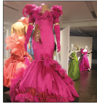
Show: La Cage aux Folles Title: Birdland Gowns (Charles James-Inspired) Costume Designer: William Ivey Long