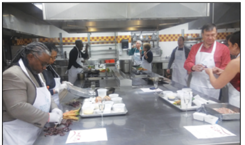
Date Night class on February 9.