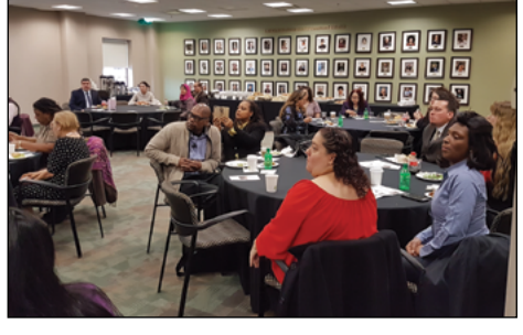
HCCC's Division of Continuing Education and Workforce Development and WomenRising celebrate the 23rd cycle of Community Partnerships in Hotel Employment program on January 29, 2018.

Our CPHE Cycle 23 students came from many different backgrounds, but they had a singular goal: to help each other find employment. Each day, they not only applied themselves to their studies, they shared their resources with each other. Because they cooperated as a team instead of competing as individuals, they not only have new jobs, they now have new friends. The network that the CPHE Cycle 23 students have formed will serve them well for years to come.