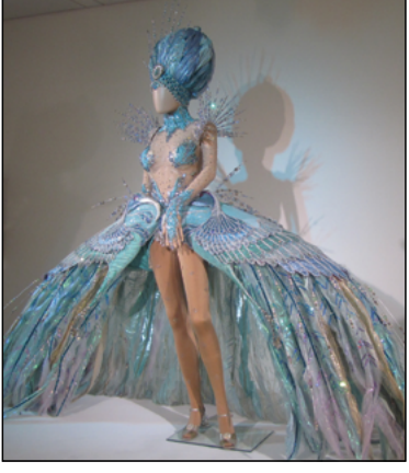
Show: Follies Title: Loveland Showgirl (Fourth Cavalier) Costume Designer: Gregg Barnes