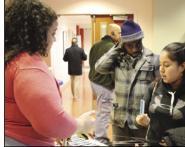
The Office of Student Activities held Involvement Fairs on Tuesday, Feb. 19 at the North Hudson Campus and on Thursday, Feb. 21 at the STEM Building. These events allowed students to sign up for clubs they may be interested in joining and meet with club officers.