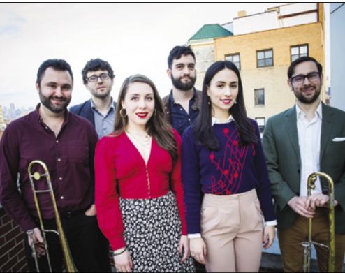
The Ladybugs performed two live jazz sets during the "Notes & Tones" Exhibition Opening Reception, which was recorded by WBGO and broadcast on air.