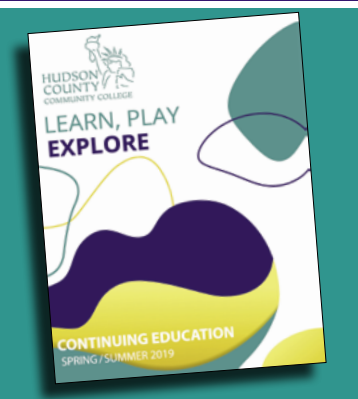
Continuing Education's Spring/Summer 2019 catalog is now available!

Date: Saturday, March 30 Time: 11 a.m. – 3 p.m. Price: $5 per student Register at www.tinyurl.com/WomensHistoryDolls