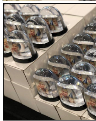
Student Activities kicked off the semester with "Welcome Back" events on both campuses, including a Welcome Back Breakfast, School Supplies Giveaway, Hot Cocoa Bar, Empanadas in the Evening, and Personalized Snow Globes.