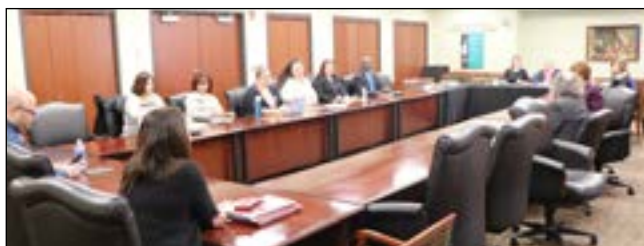
The ATD Coaches meet with the Onboarding Think Tank and Testing, a group charged with mapping out the prospective student and enrolled student experience.