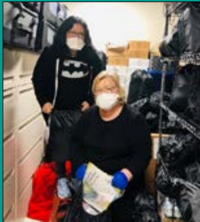
The Division of Nursing and Health Sciences donated additional PPE materials in April to Christ Hospital and Hoboken University Hospital.