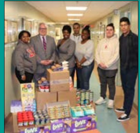
Through a donation drive, the Food and Shelter Coalition of Hudson County donated 548 food items to Hudson County Community College's Food Pantry. The goods were delivered to the College on Monday, March 9.