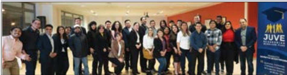
The North Hudson Campus hosted the New Jersey chapter of Organización Juventud Ecuatoriana for JUVE EXPO 2020.

On Saturday, Feb. 29, the North Hudson Campus hosted the New Jersey chapter of Organización Juventud Ecuatoriana for the annual JUVE EXPO 2020 event. The event was the first general meeting for prospective volunteers and members, where they presented to the community calendar events and activities for the year. JUVE seeks to provide services to the Hispanic community who are in pursuit of their goals in higher education.