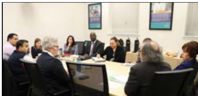
The ATD Coaches meet with HCCC's Core/Strategy Team.