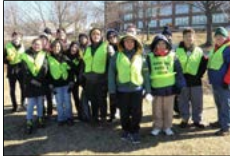
Beta Alpha Phi participated in the Bayonne Nature Club Cleanup at Ahern Stadium Park on Feb. 15.