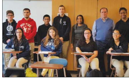
Harrison High School STEM Academy students taking Dual Enrollment Courses through Project L.E.A.P.

HCCC's L.E.A.P. has developed its first STEM cohort program, in partnership with Harrison High School. The Harrison STEM Academy students are enrolled in two college courses this spring, 2016 semester. The students are slated to enroll in three more college courses for the Fall 2016 and Spring 2017 semesters. By the time each of these students graduate high school, they will have accumulated a total of 18 college credits.