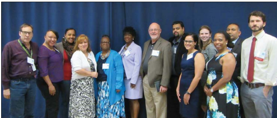
Numerous departments and divisions from Hudson County Community College were represented at the conference.

On Friday, April 22, the New Jersey Council of County Colleges hosted its annual Best Practices Conference at Middlesex County College. The event featured best practices presentations from colleagues and peers that connect to the Big Ideas Project, numerous vendor tables, networking, and much more.