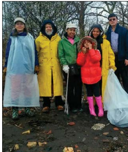
Engineering Science and environmental science students, and mathematics instructor, volunteered with the Friends of Liberty State Park on April 2.