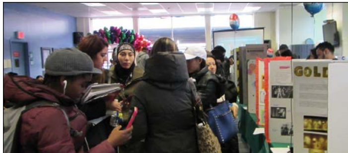
Academic Foundations English students participated in the event by preparing posters, reading essays, and performing in an open mic session.