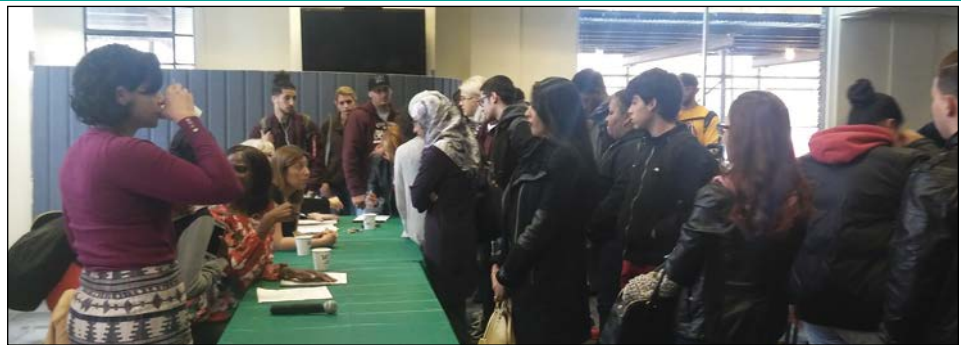
Students approach panelists with inquiries during a discussion on "Women in the Workplace" on March 29.

Panelist shared how they chose the career they did, what should women know who want to go in their particular careers, and they shared ideas on how to manage the challenges of balancing life/work/and personal needs.