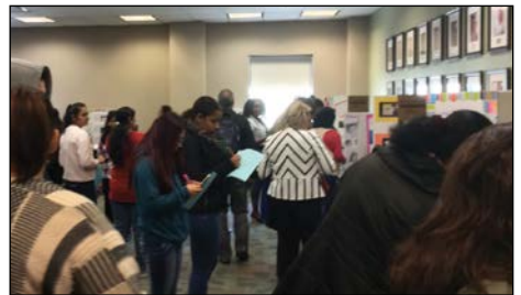
Attendees are interacting with the LC Students - Poster Presenters, and completing evaluation sheets to vote for the best poster.

In the last part of the program, a raffle draw was held for all who completed the Best Poster