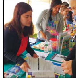
Community Education at Liberty State Park's Earth Day Celebration on April 23.

Bull Arena. Program, service and course information was shared with guests attending the event.