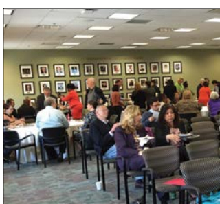
More than 90 College faculty, staff and administrators attended an April 21 town hall meeting discussing enrollment and retention.