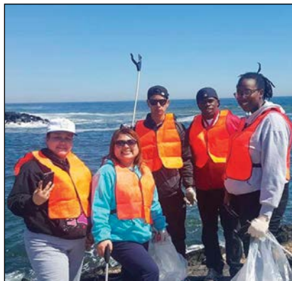
Beta Alpha Phi participated in a Beach Cleanup in Belmar, NJ on Sunday, April 17, 2016.