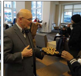
The STEM Division celebrated Pi Day on March 14. The value of pi is approximately 3.14159.