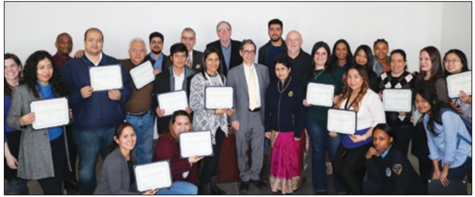
Members of the Division of Academic Affairs with students who qualified for the Fall 2017 (full-time) and calendar year 2017 (part-time) Dean's Lists in a reception on March 22.