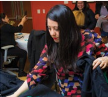
Students were encouraged to join the Hudson County Community College Alumni Association during the Grad Salute. Those who did received an Alumni