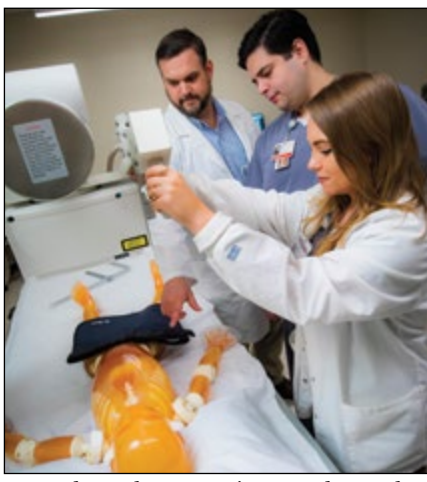
The Radiography Program's new pediatric phantom was made possible through a Perkins Grant. The phantom is equipment which will be used in training students.