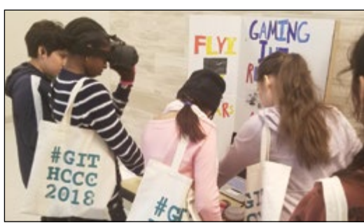
Scenes from the Girls in Technology Symposium on March 29 at HCCC's STEM Building.