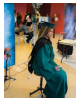
In addition to the other services Grad Salute has become known for, students were also able to take their yearbook photos.