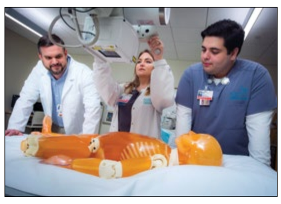
The Radiography Program recently acquired a pediatric phantom, a lifelike device used for teaching and training. It is located in Room 218A of the Cundari Center at 870 Bergen Ave.