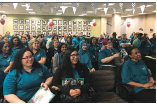
The Student Affairs Division wearing their new HCCC polo shirts - a thank you for their hard work during Spring 2018 registration!