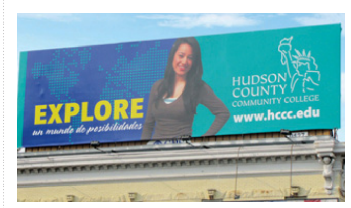
HCCC's Spanish billboard at Bergenline Avenue and 47th Street in Union City.

Ladson County Community College's Communications Department recently updated its external billboards and other advertising. Both the English boards in Jersey City and the Spanish board in Union City, pictured above, use photos of actual HCCC students. The department seeks photo shoot volunteers for images in its marketing pieces every spring.