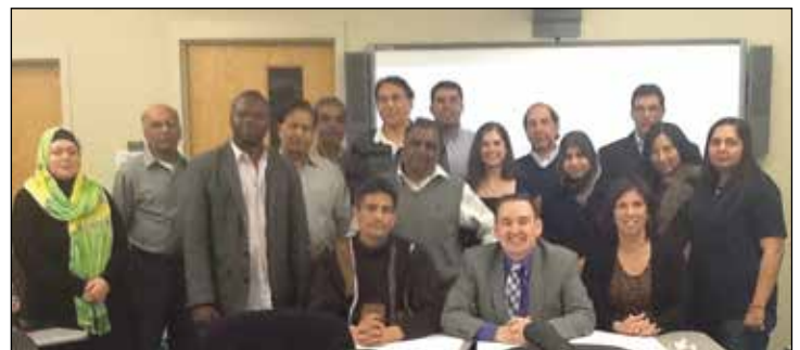
HCCC math faculty participated in a workshop on "Cooperative Learning in the College Mathematics Classroom" in October.

The workshop was funded by the Title V Grant: Building a 21st Century Community College: Strengthening Math and Technology Programs. It was well received and successful. Thanks to all who attended and made this opportunity possible.