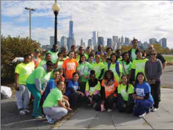
The first HCCC Community Service Day took place on Saturday, October 12. The team of volunteers worked to beautify Liberty State Park.

On Saturday, October 12, Hudson County Community College's Division of Student Affairs hosted its first HCCC Community Service Day as the culminating event of Wellness Week. Volunteers participated in the Earth Keepers project at Liberty State Park which was sponsored by Jersey Cares. With about 40 volunteers, the HCCC team worked on digging holes and trenches to plant bulbs of tulips and narcissuses on Freedom Way.