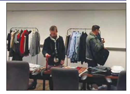
Veterans acquiring free formal attire for interviews at the Veteran's Closet, held in the Culinary Conference Center.

On Wednesday, Oct. 14, CBI staff attended an open house at Goodwill Industries' Harrison headquarters in celebration of the organization's 100th anniversary. CBI and Evening, Weekend & Off-Site Programs joined Community Education to promote the Non-Traditional Programs' range of services to the businesses and community members