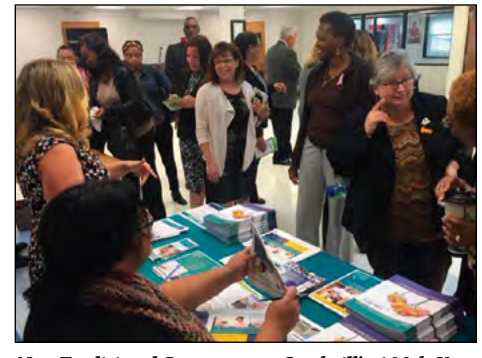
Non-Traditional Programs at Goodwill's 100th Year Anniversary Open House in Harrison, New Jersey.

On Oct. 21 CBI, in partnership with the Early Childhood Education Department at Hudson County Community College and the Greater Bergen Head Start Childcare Center located in Jersey City, began training for the Child Development Associate (CDA). Eligible candidates will be prepared in the CDA National Credentialing process, and provided comprehensive instruction in childhood education