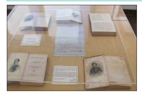
Civil War and post-Civil War era ephemera and books on display in the Dineen-Hull Gallery.

Each month, this page in HCCC Happenings provides updates on artists whose work is in the collection, and new additions to the collection.