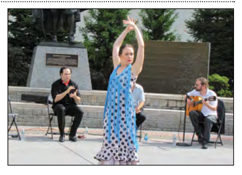
The "Flamenco Vivo" troupe performed traditional music and dance at an outdoor performance on Sept. 29.

Please contact Marsha Stoltman at (609) 588-8703 or marsha@thestoltmangroup.com with any questions.