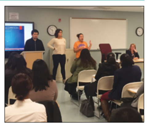
Seniors in the Registered Nursing program lead a question-and-answer session with guests at an Oct. 18 information session.

Additional information regarding both programs may be obtained at an upcoming Open House, which will be held on Saturday, Nov. 18, 2017 from 10 a.m. to 1 p.m. at the HCCC Culinary Conference Center, 161 Newkirk Avenue in Jersey City.