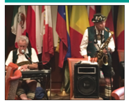
Members of a live band provide entertainment at the HCCC Foundation's Oktoberfest event.