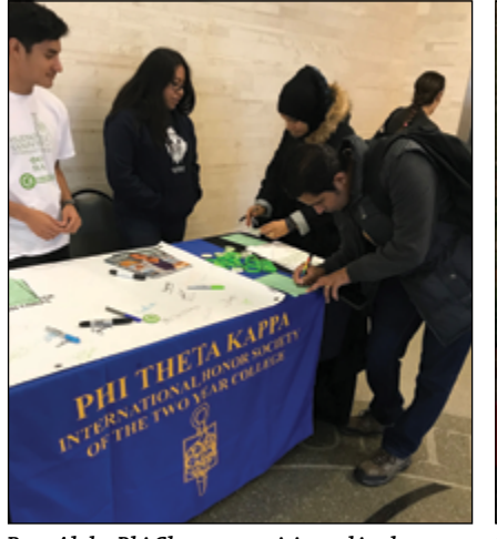
Beta Alpha Phi Chapter participated in the statewide #NJC4 college completion initiative.