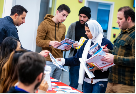
University and WomenRising, Inc. HHRC provides information on access to services, programs, and resources that assist in addressing basic needs beyond the classroom.

n Monday, Oct. 3, the Hudson Helps Resource Center (HHRC) held a Fall Resource Fair at the Student Center. The event featured local community partners from around Hudson County, including New Jersey City