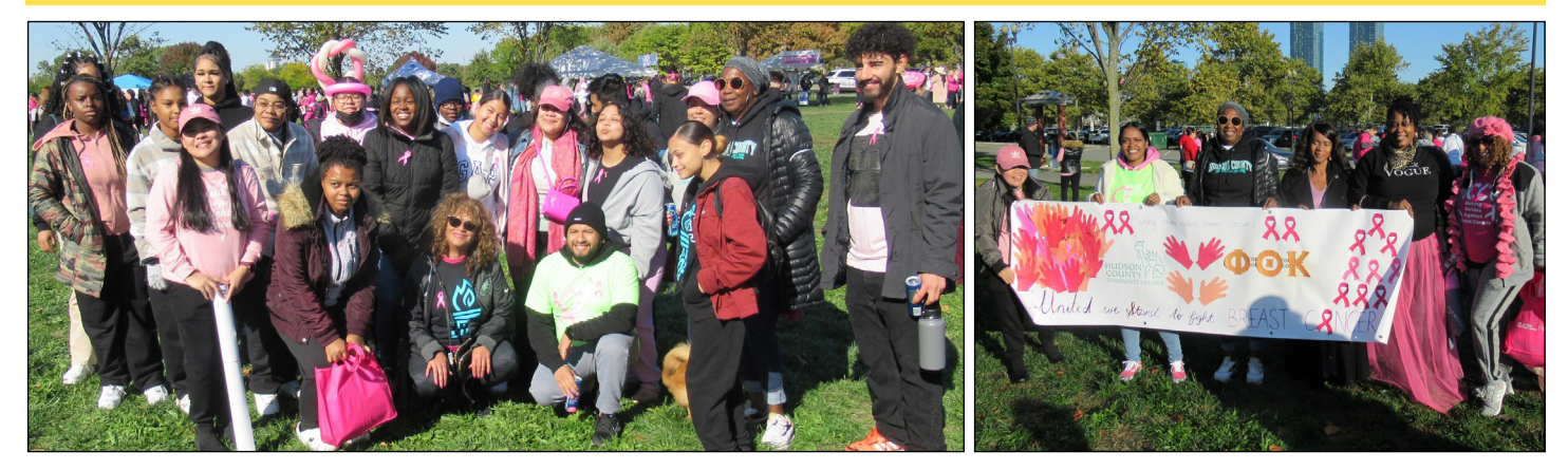
Team HCCC-PTK at Making Strides of Jersey City Presented by Goya on Sunday, Oct. 9.