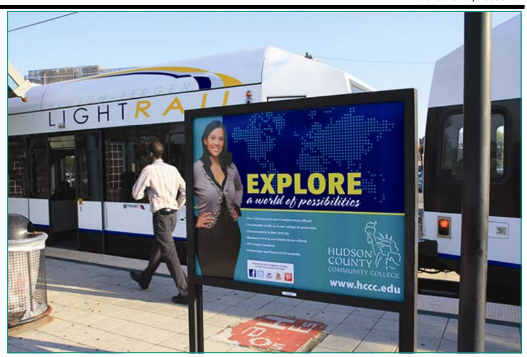
▲ HCCC's marketing materials at the Pavonia/Newport station of the Hudson-Bergen Light Rail. The pieces are customized for light rails and buses as part of the transit campaign.

Although this workshop is free, pre-registration is required. To register or to obtain more information is available at www.thefate.org.