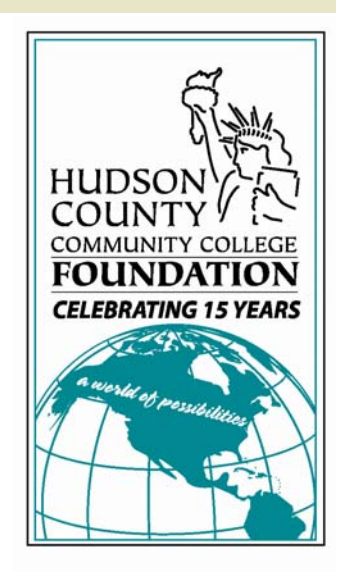
Foundation is a 501(c)3 corporation giving tax-exempt status to contributors.