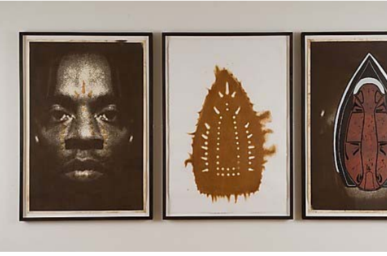
▲ WILLIE COLE'S "Man, Spirit, Mask" is part of the College's permanent art collection. The art will be installed in Journal Square.

Mr. Cole is, perhaps, best known for assembling and transforming everyday objects — such as steam irons, ironing boards, high-heeled shoes, hair dryers, wood matches, bicycle parts, discarded hardware and lawn jockeys — into imaginative works of art. He often builds meaning into his works through the repeated use of a single object in multiples. His work appears in numerous private and public collections and museums, including the Art Gallery of Toronto (Canada), Baltimore Museum of Art, Dallas Museum of Art, Detroit Institute of Arts, Metropolitan