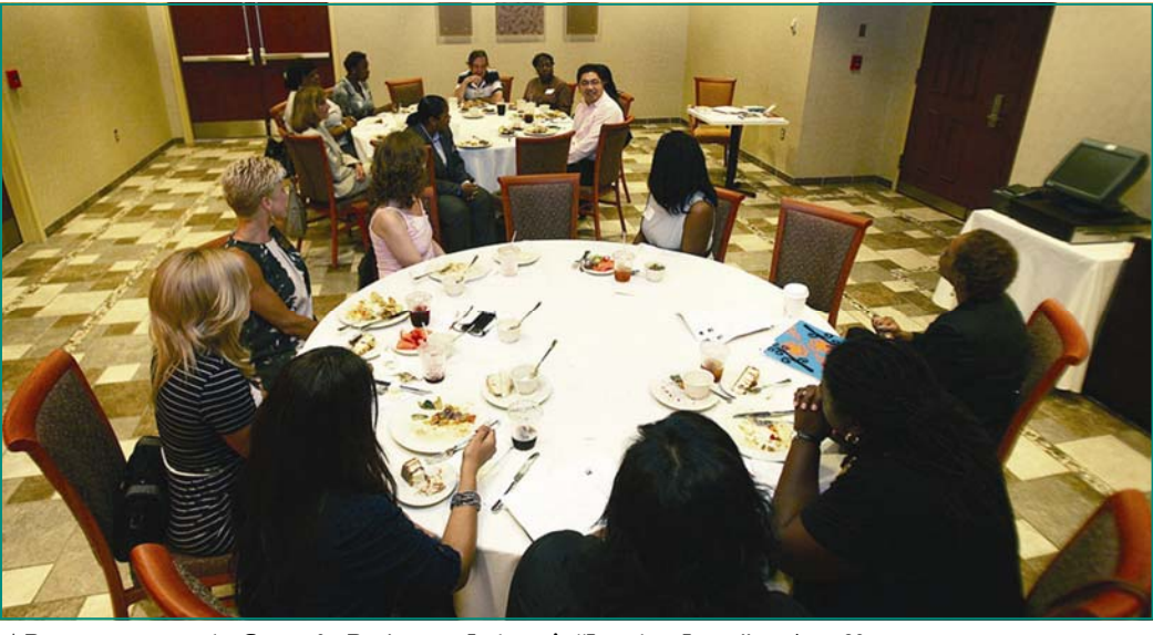
▲ PARTICIPANTS IN the Center for Business & Industry's "Lunch & Learn" on Aug. 28

The Job Fair is open to Hudson County residents who are 18 years of age or older and who possess a high school diploma or GED. Job-seekers are asked to bring copies of