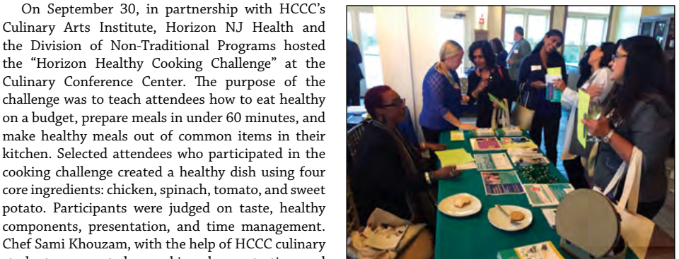
NTP staff at the Hudson County Chamber of Commerce's SchmoozaPalooza event at Liberty House on September 28.

"Financial Abuse," "Worker's Rights to Paid Leave," "Money Talk for Parents," "Crime Victim Rights & Compensation," and "Financial Fraud, Identity Theft, and Consumer's Rights When Dealing with Debt