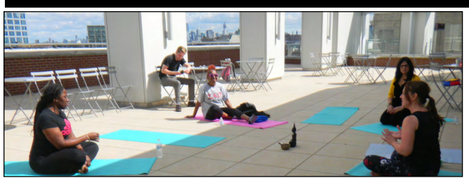
Members of the HCCC staff participated in an "Art of Yoga" session on Tuesday, Sept. 24. For additional information, see right column.

PERENNIAL FALL ISSUE LAUNCH October 15, 6-8 p.m. Dineen Hull Gallery Atrium