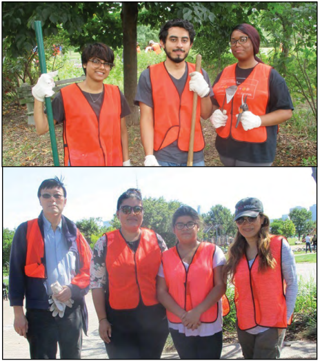
Beta Alpha Phi Chapter volunteered with the gardening project at Liberty State Park each Saturday in August and September.