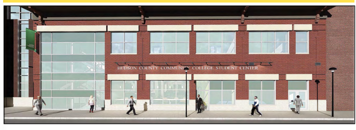
Architect rendering of the forthcoming Student Center.