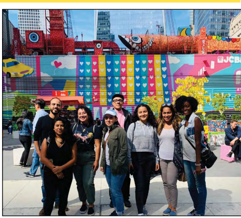
On Friday, Sept. 20, STEM and Environmental Club members participated in the Climate Change strike in lower Manhattan.