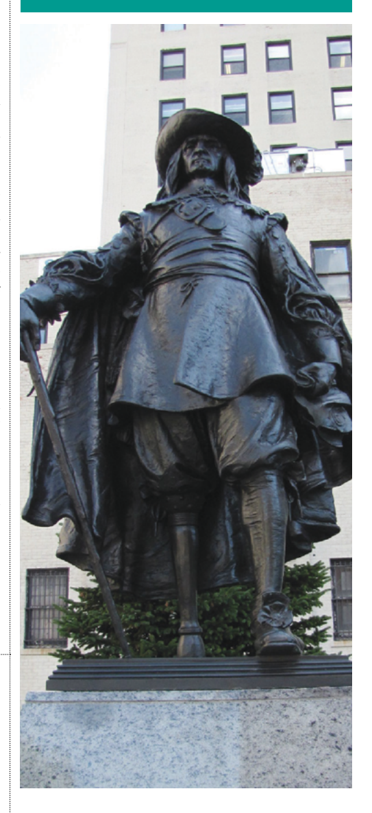
The historic statue of Peter Stuyvesant, located in Culinary Arts Plaza, is on gracious loan from the City of Jersey City.

high-quality, cost-effective, and customized training at times and places that are convenient to the organizations.