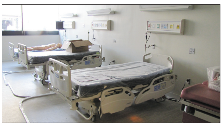
This simulation room contains all of the components of an actual hospital room. Here, nursing students will learn practical skills.