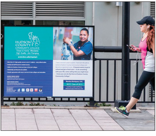
Clockwise from left: Bus sign, Journal Square, Jersey City. Interior bus sign. Transit sign at Hudson Bergen Light Rail, Harborside Financial