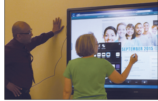
The Center for Online Learning trained CarePoint faculty and staff on the new Sharp Aquos boards at 870 Bergen Avenue (Building F).