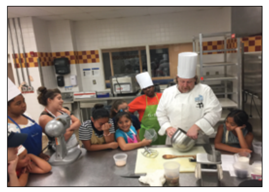
Community Education students enjoying Summer Youth culinary classes.

NPTNJ is a partnership between New Jersey City University and many community colleges across the State of New Jersey. The program offers a statewide alternate route teacher preparation program designed to provide candidates with the skills and strategies necessary to become excellent, successful teachers in diverse classroom environments.