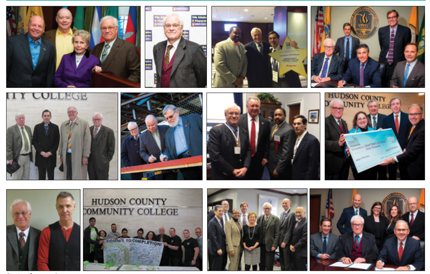
Continued on page 9

began year-round organizing and providing the community with art exhibits and a performing arts series free of charge, plus trips to sports and theater events at greatly reduced costs.